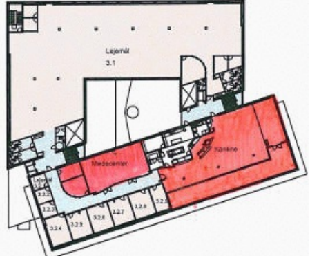
Overordnet plan disponering / 2. sal plan