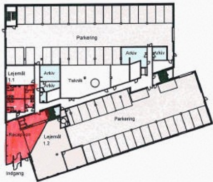
Overordnet plan disponering / Stueplan