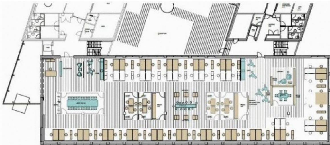
PLAN OF 1st FLOOR - SCALE 1:200 35 WORKSTATIONS WITH POSSIBILITY OF INCREASING TO 55 WORKSTATIONS